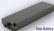
Onyx Battery. Common to all models.