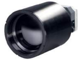
WFOV & NFOV lens options available from 7.5mm to 100mm