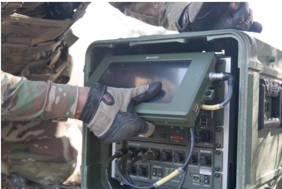
MilDef's 19"/2 design, including rapid setup and operation, enables operators to conduct training and simultaneously test mission equipment while in transit to Areas of Operation.

The mobile, re-deployable design of 19"/2 kits provides an opportunity to train on the same systems that Marines take to the fight, from the schoolhouse to the garrison to afloat. In other words, being able to quickly set up, configure, and run mission scenarios in any environment means Marine operators have more training opportunities beyond formal schoolhouse and garrison training events. Additionally, the ability to train afloat while transiting to the area of operation ensures training is up to date with the most recent mission objectives.