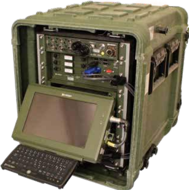
Mobile Core Server System