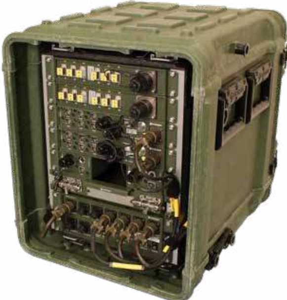
Mobile Core Network stack including UPS