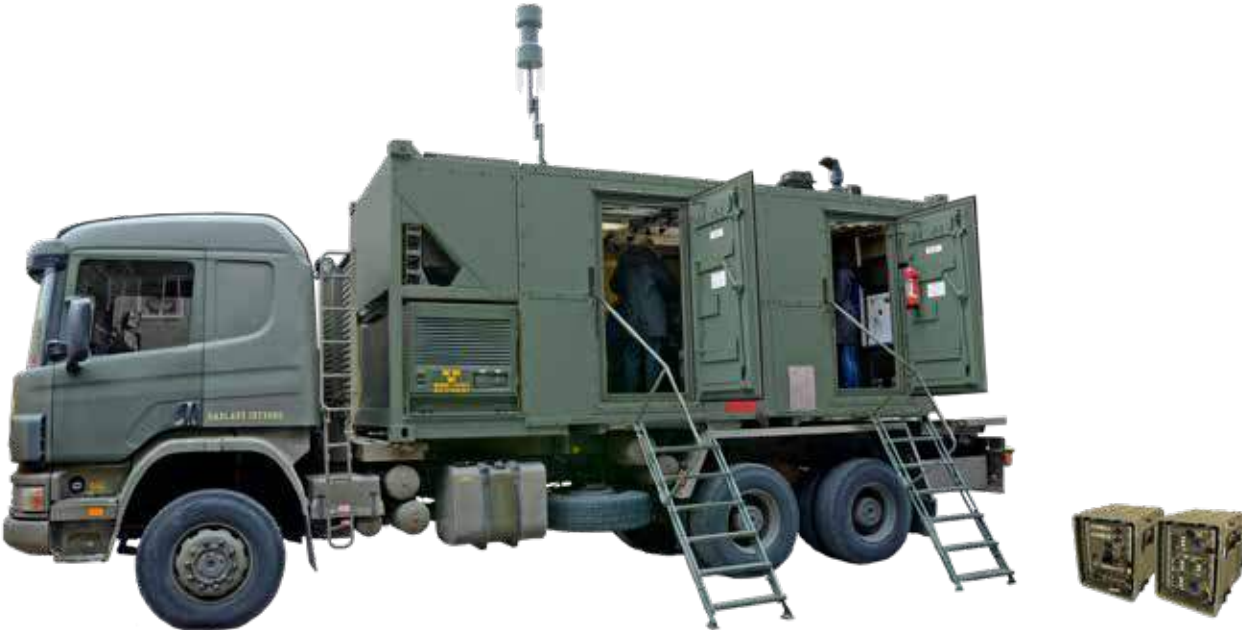
Vehicle-based network node compared to the Mobile Core Network cases